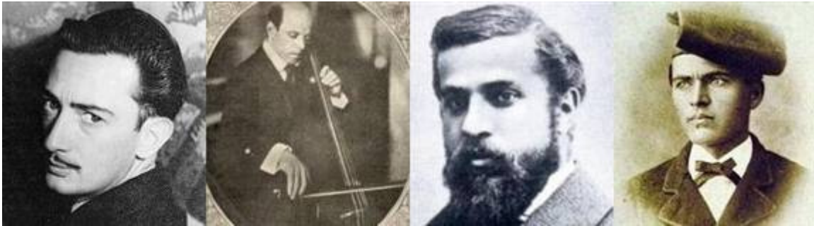
Salvador Dalí, surrealist