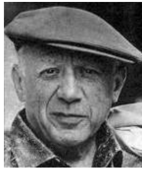
Pablo Picasso, the cubist

Pablo Picasso, learned to use his drawing lápiz (pencil in Spanish, also in Serbo-Croatian "lapis") in Barcelona, where he started his unique creative act in cubism, shuttling between Barcelona and Paris.