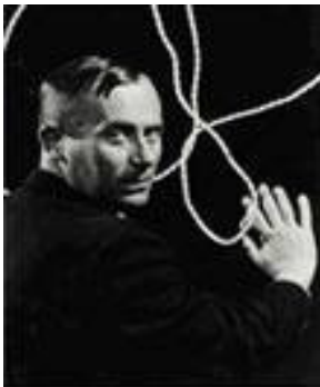
Joan Miró, the painter