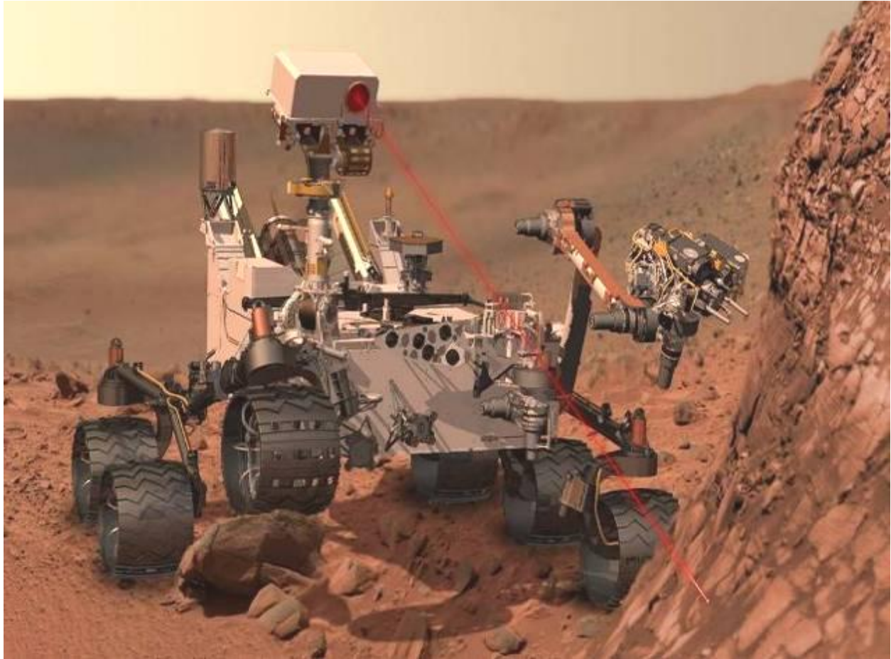
Fig. 5. The Curiosity rover on location in a Mars crater, opening the laser to research the nature of the crater's stone wall...it's the onboard laboratory sending back by radio data results of the operation to Caltech HQ in Pasadena, CA.