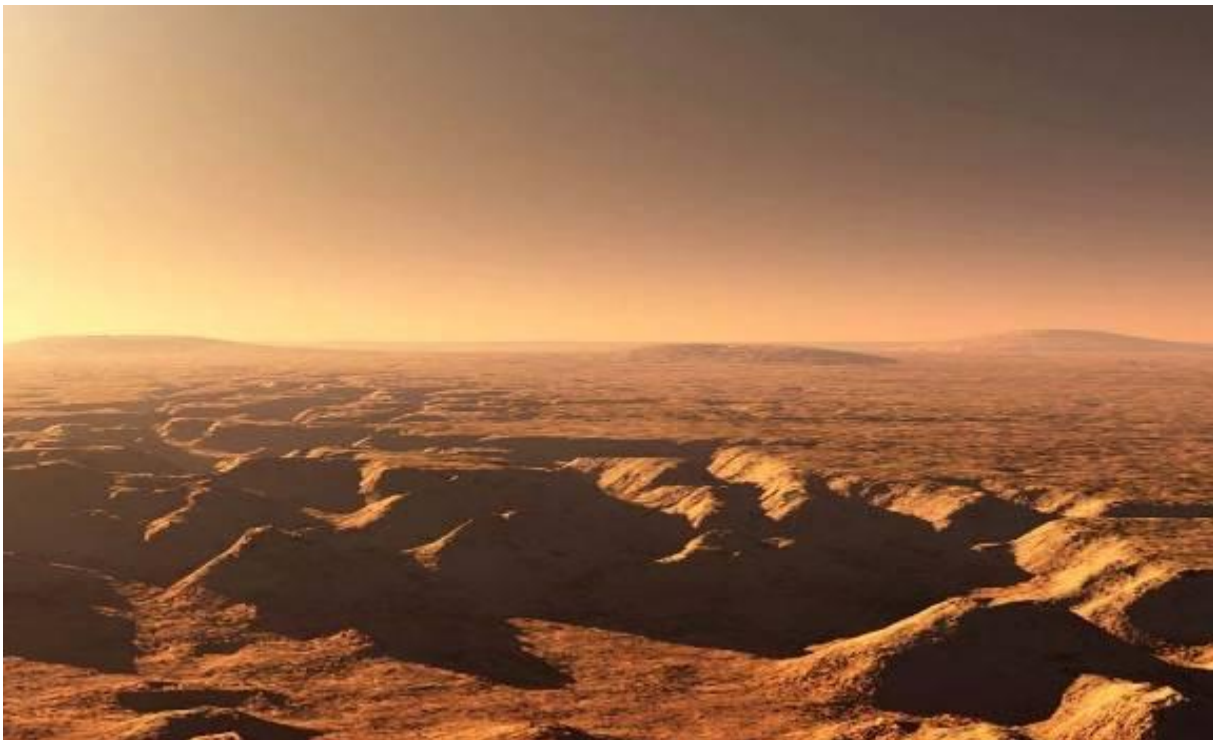
Fig. 4. The Elysium Planitia region of Mars, rolling hills in fact, which is typical of the arid American Wild West.