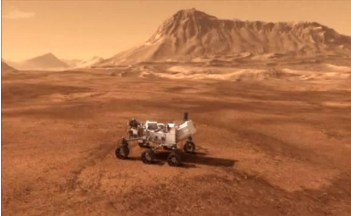
Fig. 3. Curiosity Rover on Mars; self portrait (a little fuzzy frame), with surely an exotic mountain range in the background, a rarity?! The little rovers have now turned into auto-size vehicles, and have been the real heroes in documenting various aspects of the hostile Martian environment. This mountain in the background is very impressive—Mt. Sharp—rather unusual for the typically flaccid Martian surface, with the exception of Olympus Mons, the tallest mountain range in the Solar System: 22 km high (13.6 mi or 72,000 ft.), created by the pressure of the Venusian collision with Mars, 2.8 billion years ago.