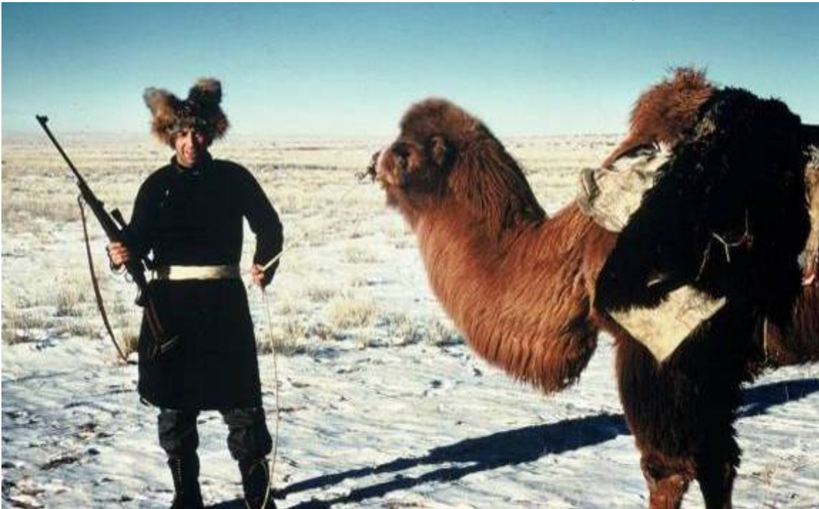
Cover page, jacket: Tales from the OPEN SPACES , children's book... Here, I was a baby really, early 1960s en route to the Takla-Makan desert of northwestern Red China to monitor their first A-bomb detonation, which is a full chapter in the Cold War trilogy ©2005.

—Austrian journalist Karl Kraus, explaining the causes of the 1914-1918 World War, cited at “ The Best War Ever. ”