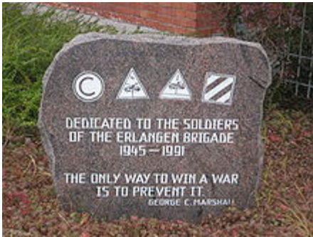
Fig. 2. Ferris Barracks Memorial to the Soldiers of the Erlangen Brigade from 1945-1991 Dedication stone (left) posted in Germany, ironically reminds burnished in stone, that we Americans are perennially at war, occupying any nation we can by stationed troops on its soil, to guarantee domination of that country, including directly spying on its neighbors if such countries are not allied and part of the perfidious American hegemony, globalization, integration and prevailing dominance cavalcade for final takeover of global worldwide meridians. Our Armed Forces on active duty and in paramilitary formations are listed accumulatively at almost 3 million men de facto in uniform.

powers and the Soviet Union; the Russians left Eastern and Central Europe, initially occupied, but we the American conquistadors remained, still occupying almost all of the countries we freed from the Germans, stationing considerable contingents of troops on their soil at their national cost, cleverly but surely advancing the dominance plans of Washington on the continent of Europe.