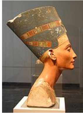
Nefertiti, Akhenaten's billowed queen.