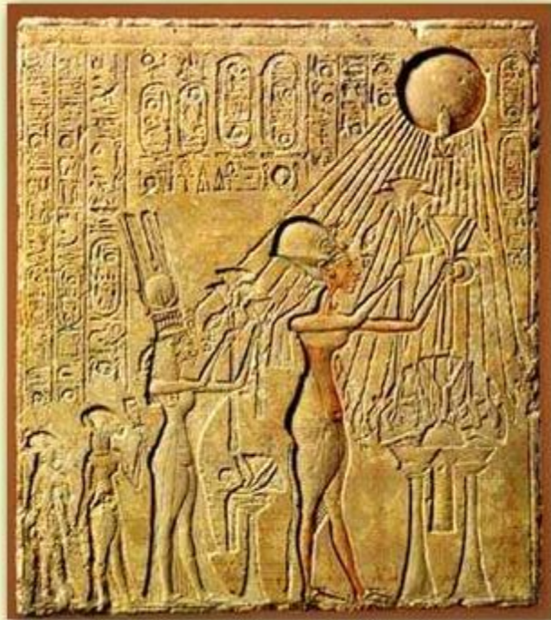
Fig. 1. Pharaoh Akhenaten, his beloved Queen Nefertiti, and family adoring the Aten, their Sun God; second from the left is Tutankhamen who was the son of Akhenaten. The relief dated 1350BC of the sun disk of Aten is a lime stone slab, with traces of the draftsman's grid still on it, found in the Royal Tomb of Amarna, the ill-fated capital of the founder of monotheism long before Moses claimed it for Judaism.

Aten is a creator of the universe in ancient Egyptian mythology, usually regarded as a sun god represented by the sun's disk. His worship (Athenism) was instituted as the basis for the mostly monotheistic — in fact, monistic — religion of Amenhotep IV, who took the name Akhenaten. The worship of Aten ceased shortly after Akhenaten's death; while Nefertiti was knifed to death by the Amun priesthood!