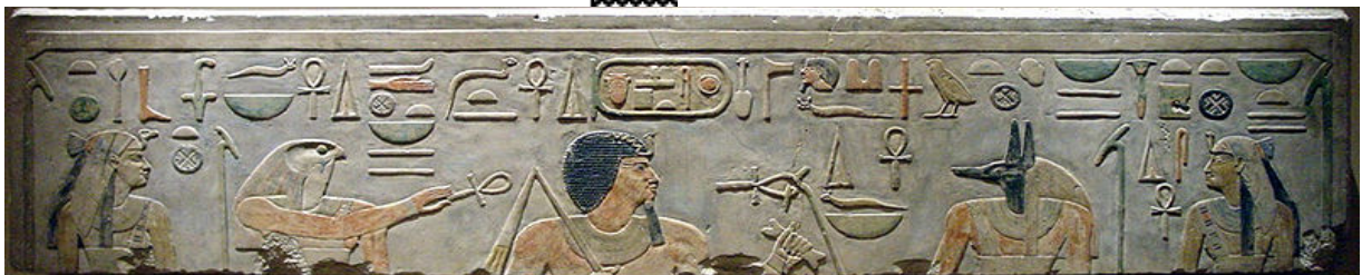
Fig. 3. A raised-relief depiction of Amenemhat I accompanied by deities; the death of Amenemhat I is reported by his son Senusret I in the Story of Sinuhe .

[Credit: Above pictographs, Amenhotep and Aten in hieroglyphs, the rest in the public domain.]