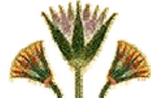
The bird of Paradise symbology.