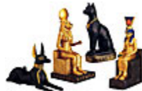
Credit: all the graphic material and/or quotations used, unless otherwise stated are in the public domain.

During the reign of Amenhotep III (Akhenaten's father) artists began to depict nature in all its glory in a naturalistic way not common to traditional Egyptian art dimensional art. This art form was also apparent during the reign of Akhenaten as his worship of the sun disc included a reverence for the natural world. The depictions of nature from this period are amongst the most beautiful works of art recovered from Ancient Egypt. The Dalmatian canine breed seems to have had its genetic roots in the Nile Delta among the pharaonic aristocracy. Akhenaten surrounded himself with a number of powerful women whom he obviously adored and respected. Each of the royal women had her own private sunshade temple where she could worship the Aten. They were generally located within beautiful gardens complete with ritual pools where the wonders of nature could be enjoyed. The Amarna women, in particular Nefertiti, seem to have represented the feminine aspect of the Aten as creator with a biogenic aesthetic verve... Could the Maker of Adam or Eve, be an aesthete?!