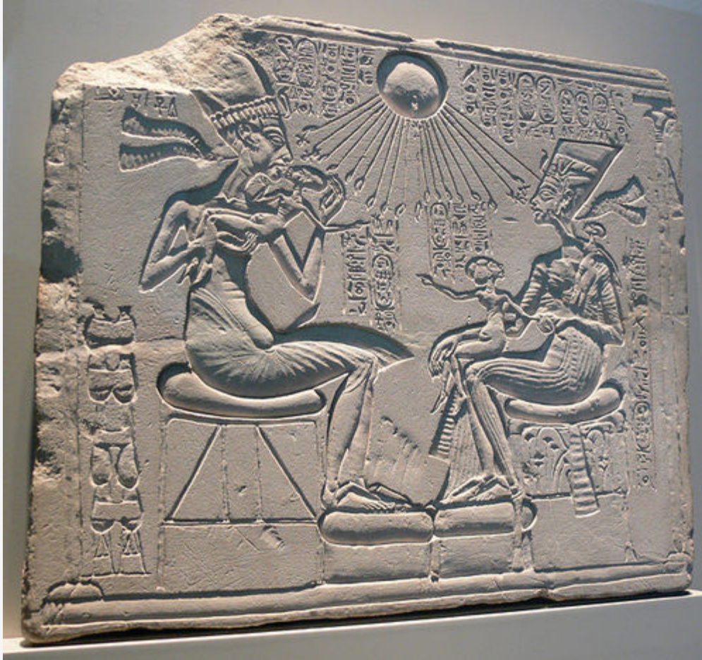
A house altar showing Akhenaten, Nefertiti and their two daughters; the pharaoh kissing the one in his arms, while the other sibling, sitting in her mother's lap seems to be jealous...; very interesting and intimate family scene, unusual for the static 'dimensional' Egyptian art. It's a small limestone piece from the Amarna period, c. 1350 B.C. Ägyptisches Museum Berlin, Inv. no. 14145.