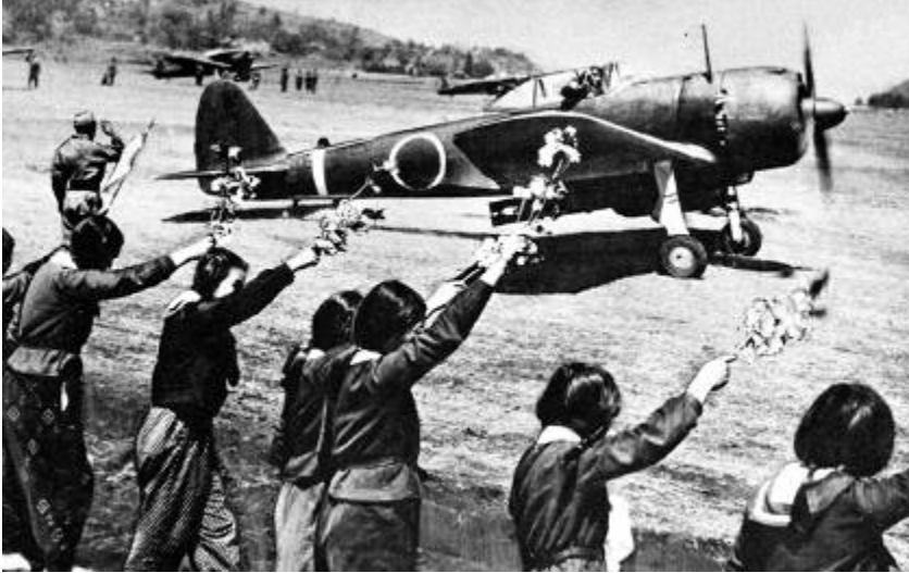
Fig. 7. Wartime high school cheerleaders begging off a kamikaze pilot, with flowers and good wishes to die heroically by smashing his bird and himself to death against an Allies warship... I have always wondered whether children and teenagers ever understood the Game of War?! Did the young ladies realize the man behind the stick was about to die... For what good purpose? So that they could live free... in 1945, When the war was over...

However, it took an American senior commanding officer – Gen. Douglas McArthur, the postwar Governor of Japan, to make these children free... Did he understand the American presence. In South-East Asia, or that dominance per se was the name of the Gothic game? etc., etc., etc... I'm not sure? Perhaps very much so, since it's in the bloodline of the Germanic breed of people!