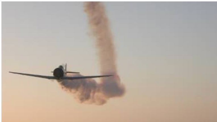
Fig. 6. The kamikaze aircraft going into in to the final deadly nose dive released the typical trade mark of the moribund heroic act – the afterburner con-trail!

The Germans were not as fanatical and suicidal, despite the obvious defeat faced in the spring of 1945, while the Oriental mind of Nips went for all or nothing, the Samurai 'banzai' action... It was much of a human tragedy perpetrated by the Japanese ruling elite as our ability to snuff out half a million innocent civilian sand to maim as many in the two atomic bombs dropped on Nagasaki and Hiroshima, August 6 and 9, 1945, and the war was in fact over?!