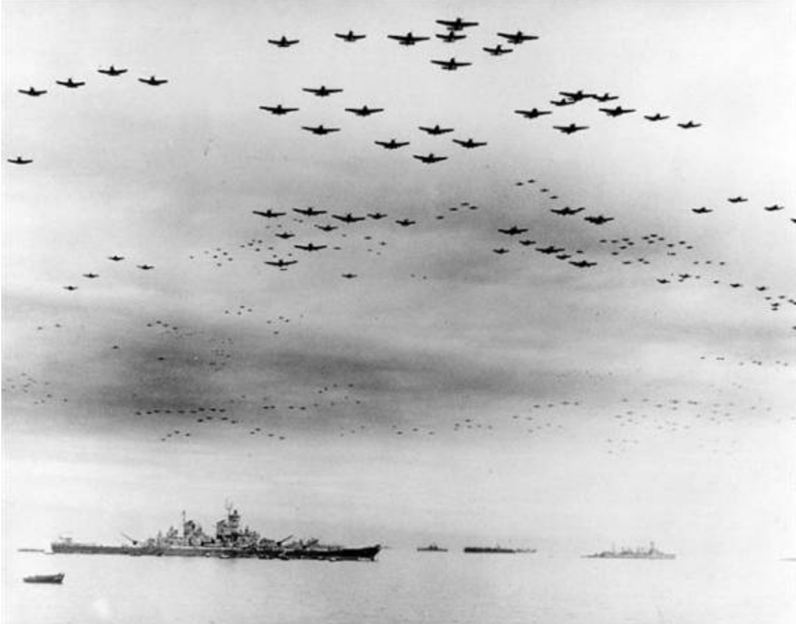
Fig. 14. 80-G-421130 Carrier planes over USS Missouri, 2 September 1945 fly in formation over the U.S. and British fleets in Tokyo Bay during surrender ceremonies. USS Missouri (BB-63), where the ceremonies took place, is at left. USS Detroit (CL-8) is in the right distance. Aircraft include TBM, F6F, SB2C, and F4U types.

The Missouri's main battery consisted of nine 16 inch (406 mm) 50 caliber Mark 7 naval guns, which could hurl 2,700 lb armor piercing shells some 24 miles away. The secondary battery consisted of ten 5 inch (127 mm) 38 caliber guns, which could fire at targets at a distance of up to 9 miles. With the advent of air power and the need to gain and maintain air superiority came a need to protect the growing fleet of allied aircraft carriers; to this end, Missouri was fitted with an array of Oerlikon 20 mm and Bofors 40 mm anti-aircraft guns to defend allied carriers from enemy air strikes. When reactivated in 1984 the Missouri had the 20 mm and 40 mm AA guns removed, and was outfitted with Phalanx CIWS mounts for protection against enemy missiles and aircraft, and Armored Box Launchers and Quad Cell Launchers designed to fire Tomahawk missiles and Harpoon missiles, respectively.