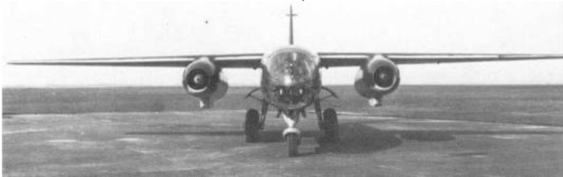
Fig. 17. In World War II, Germany had a significant advantage in several fields of high-tech weaponry, particularly noticeable at the beginning of the war, and towards the end of it, with a diverse series of innovative systems, commonly referred to at home as Wunderwaffen or German secret weapons by the Allies. The German advantage in weapons technology was not a coincidence. It was the result of three main factors:

The advanced German weapons of World War II