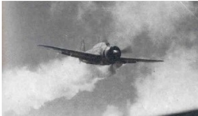
Fig. 2nd Lt. Yamaguchi’s Yokosuka D4Y3 (Type 33) Suisei diving at USS Essex , November 25, 1944. The air brakes are extended and the non-self-sealing port wing tank is trailing fuel vapor and/or smoke.