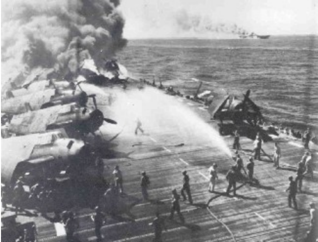
Fig. 4. Fighting fires on aircraft carrier Belleau Wood after the kamikaze attack on October 30, 1944. The carrier Franklin , also hit by kamikaze, burns in background.