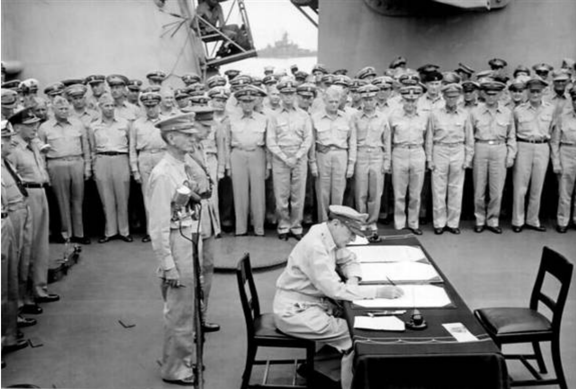
Fig. 9. American and British sailors and officers watch General of the Army Douglas MacArthur sign documents during the surrender ceremony aboard Missouri on September 2, 1945. The unconditional surrender of the Japanese to the Allies officially ended the Second World War. General MacArthur signs was Supreme Allied Commander during formal surrender ceremonies on the USS MISSOURI in Tokyo Bay. Behind General MacArthur are Lieutenant General Jonathan Wainwright and Lieutenant General A. E. Percival.

High-ranking military officials of all the Allied Powers were received on board on September 2, 1945, including (but not limited to) Free French General Leclerc, Republic of China.