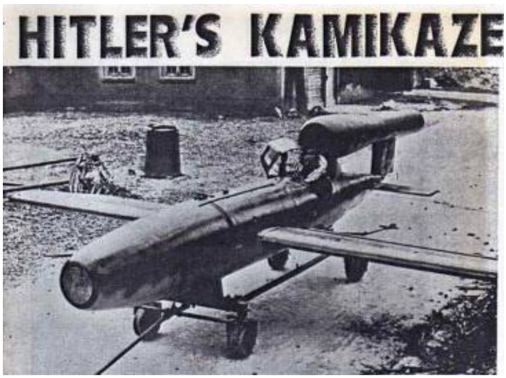
Fig. 15. The Nazi Germans were not as fatalistic as their Oriental brethren... Actually, the lady test pilot of this piloted version of the V-1, Hanna Reitsch, was the last personality to see Hitler alive; she flew in to see Hitler three days before his suicide in the Berlin bunker, April 28, 1945 (he d. April 30 th ), and landed bravely on the city street right by the Reichstag through all the Russian firepower... She was in the Otto Skorzeny aircraft (Heinkel He 111) in which he rescued Mussolini, Sept. 12, 1943. Indeed, the peanut size Flugkapitän [See, Hanna Reitsch in "A Secret Weapon" illustrated booklet in this Website.]