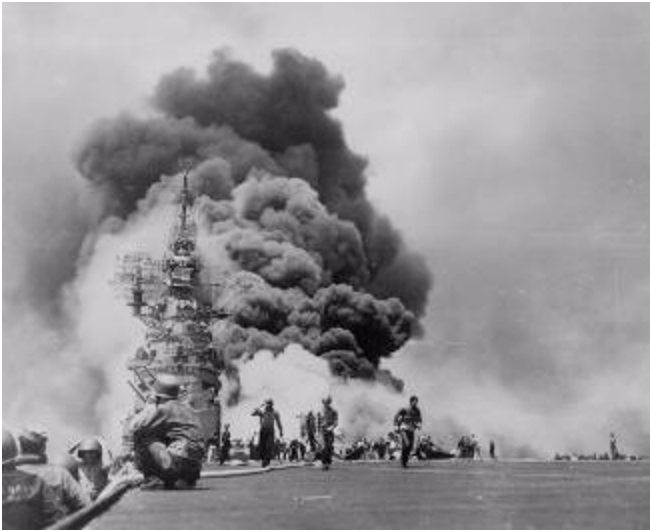
Fig. 5. USS Bunker Hill was hit by Ogawa (see picture left) and another kamikaze near Kyūshū on May 11, 1945. Out of a crew of 2,600, 372 personnel were killed.

Approximately 2,800 Kamikaze attackers sunk 34 Navy ships, damaged 368 others, killed 4,900 sailors, and wounded over 4,800. Despite radar detection and cuing, airborne interception and attrition, and massive anti-aircraft barrages, a distressing 14 percent of Kamikazes survived to score a hit on a ship; nearly 8.5 percent of all ships hit by Kamikazes sank.