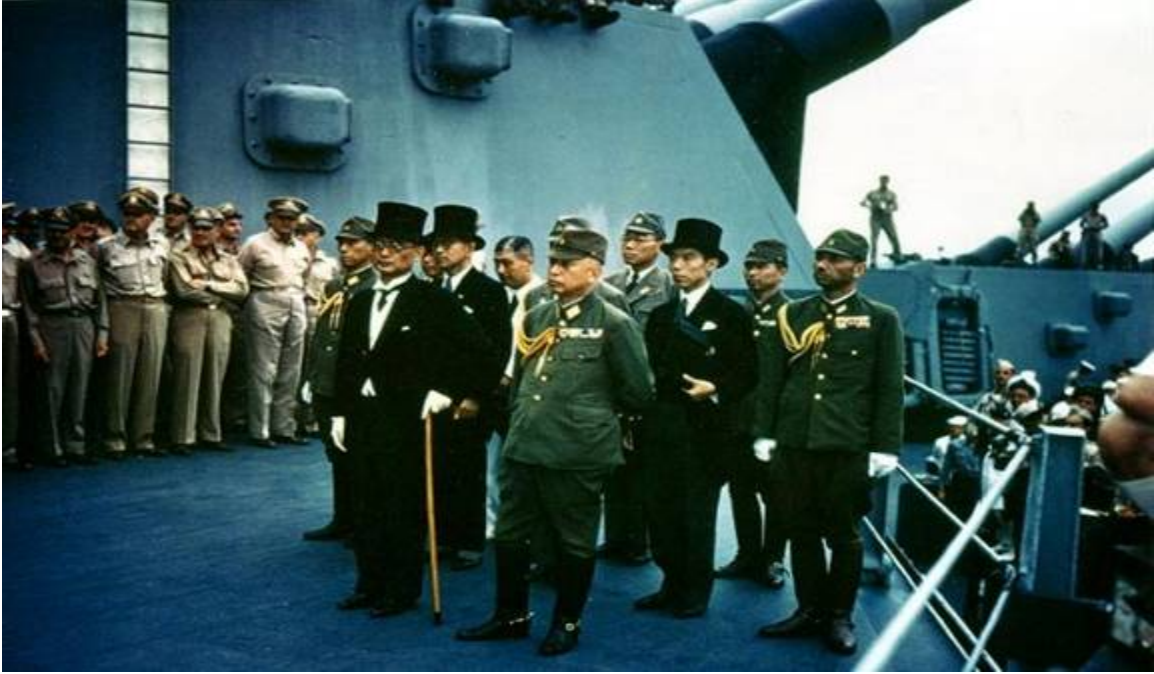
Fig. 12. The Japanese capitulation delegation in waiting aboard the USS Missouri, September 2, 1945, for the capitulation ceremony to begin.