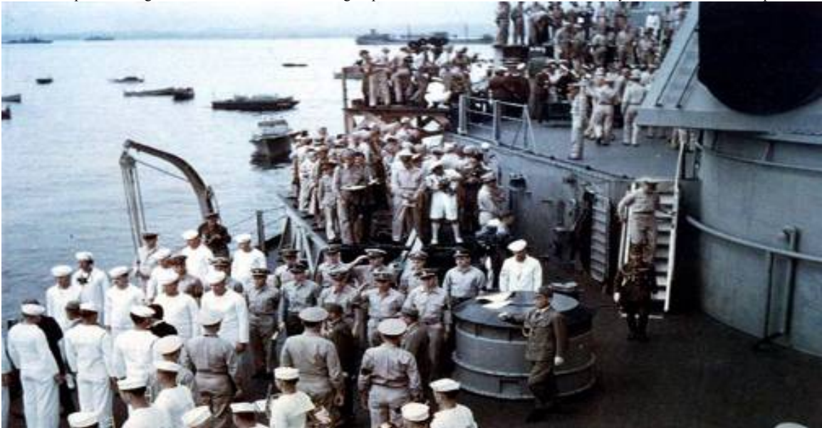
Fig. 11. The Japanese delegation leaves the USS Missouri (in shame, for the proud race) after signing the capitulation (see below).