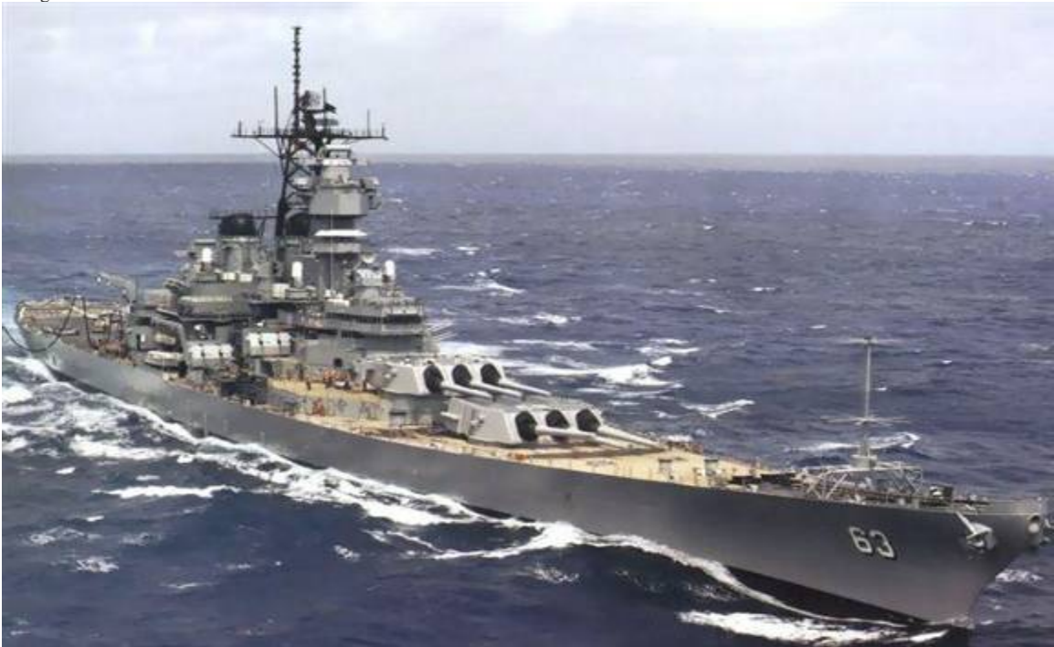
Fig. 13. The third USS Missouri (BB-63) ("Mighty Mo" or "Big Mo") is a U.S. Navy battleship, notable as the final battleship to be built by the United States, the second-to-last in the world after HMS Vanguard, and the site of the Japanese surrender at the end of World War II.