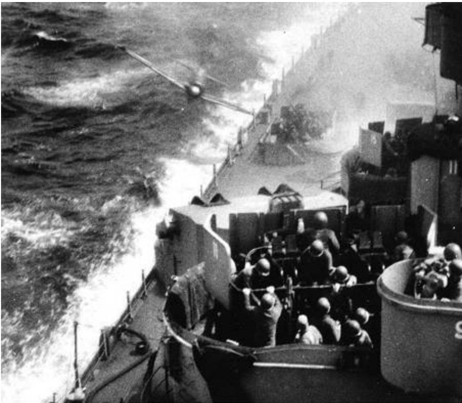
Fig. 8. Gunners on battleship Missouri aim at approaching kamikaze plane.

However, it took an American senior commanding officer – Gen. Douglas McArthur, the postwar Governor of Japan, to make these children free... Did he understand the American presence. In South-East Asia, or that dominance per se was the name of the Gothic game? etc., etc., etc... I'm not sure? Perhaps very much so, since it's in the bloodline of the Germanic breed of people!