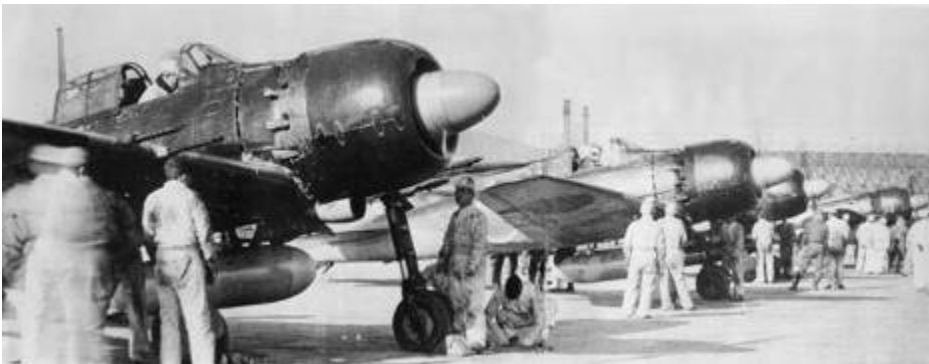
Fig. 3. Model 52c Zeroes are sent back from Korea to Kyūshū island, to take part in a Kamikaze attack (early 1945).