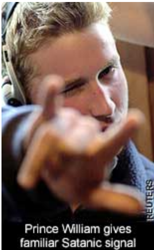
Prince William gives familiar Satanic signal