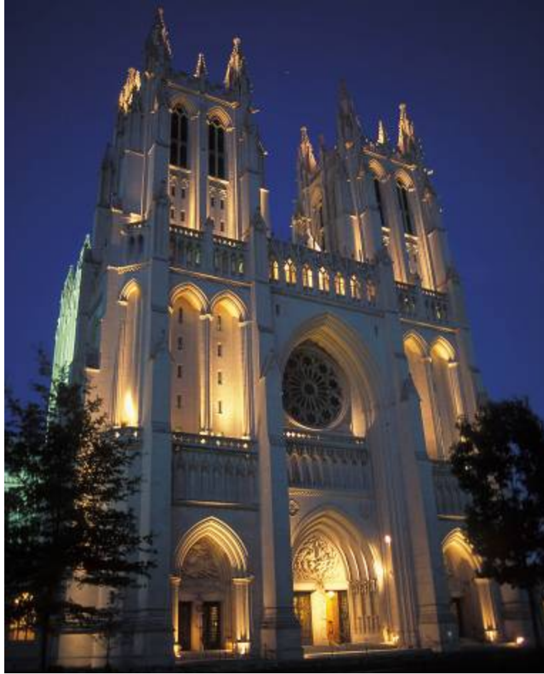
Fig. 78. National Cathedral in Washington, D.C., USA.