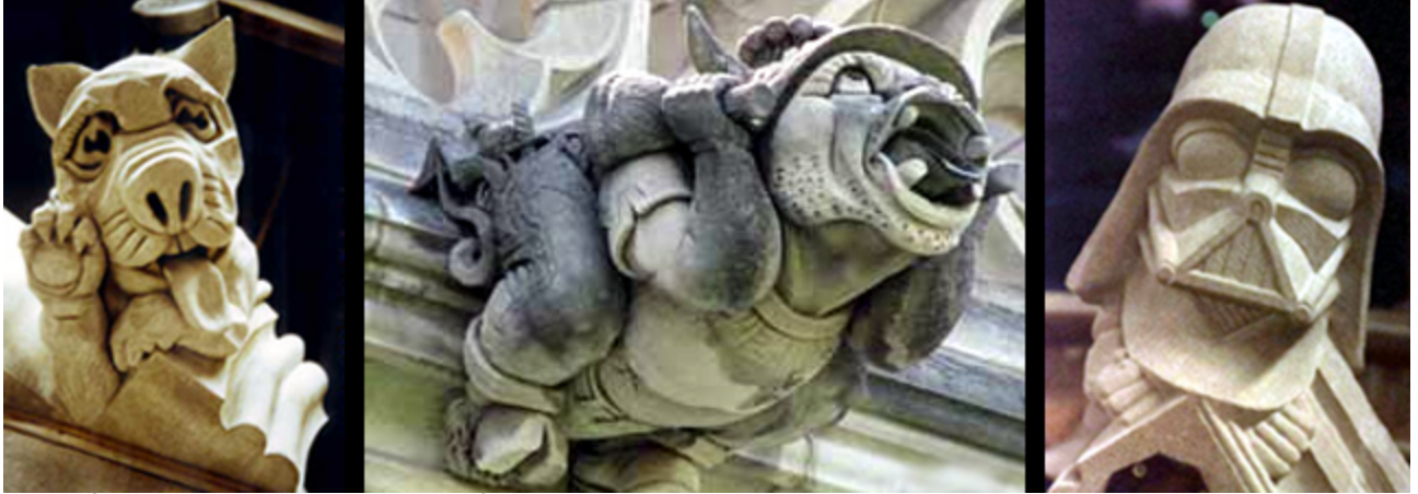
Fig. 74. Gargoyles from Washington National Cathedral.