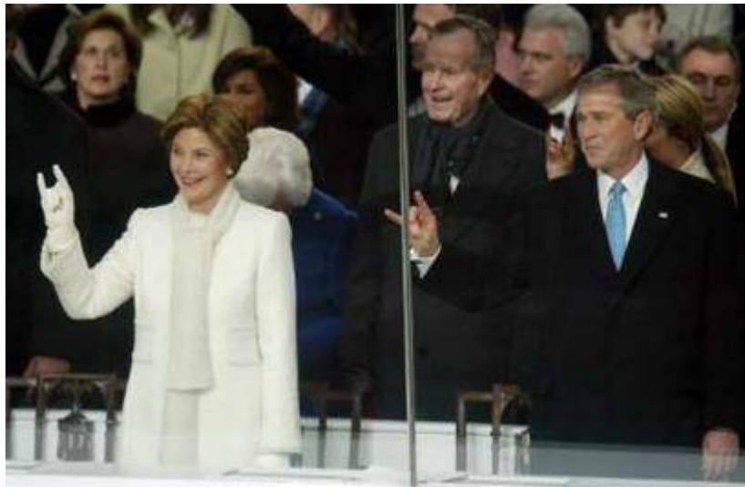
Fig. 68-69. Associated Press and Reuters called the above bush family hand signs of "Texas Longhorn" or "Texas UT" symbol. Somebody must've whispered in AP ears to write it that way.

Papa Bush, Sr. and Mother Dear, are in the background not paying attention to the well entrenched family symbols, which are also taught to the budding generations of British leaders at the Court of St. James (see below, Prince Edward frame). In other words, the recently arrived on the continent of Europe, our barbarian Goth, Oriental German breed by origin, Protestant Anglo-Saxon ruling elite (9 AD), having escaped civil rules of conduct on the civilized continent of Europe, of course, first destroying the Roman Empire-West (476 AD), thereby launching the Dark Ages on the continent to last 700 years, until the Arab influence congealed into an overall continental Renaissance, when as the adventuring Germanic elite arrived in USA, forming Fortress American back in 1776, with a single language, English,(and almost German but for one vote in the US Congress), promulgating the Law of the Land (higher than a constitution) written and enforced by the 52 Founding Fathers, and the English or western European crescent Anglo-Saxons, who