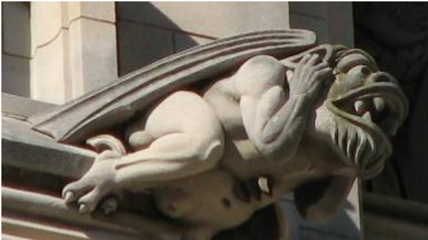
Fig. 79. This grotesque figure adorns our national house of worship, the National Cathedral in Washington, D.C.

Monsters, or more precisely chimerae, were used in America as decoration on 19th and early 20th century buildings in cities such as New York (where the Chrysler Building's stainless steel gargoyles are celebrated, see below, fig. 84), etc. Chicago. One impressive collection of modern gargoyles can be found at Washington National Cathedral in Washington, DC. The cathedral, begun in 1908, is encrusted with 112 limestone demons. This collection also includes Darth Vader, a crooked politician, robots and many other modern spins on the ancient art form. The 20th Century collegiate lore of the Gothic Revival produced many modern gargoyles, notably at Princeton University, Duke University and the University of Chicago. In contemporary fiction, gargoyles are typically depicted as winged humanoid race with grotesque, demonic features: generally horns, a tail, and talons. These fictional gargoyles can generally use their wings to fly or glide, and are often depicted as having a rocky hide, or being capable of turning into stone in one way or another. Legend has it that gargoyles ward off evil spirits - are any protecting your castle and loved ones? tsk? tsk!