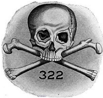
Fig. 64. Reportedly the society dates back to Demosthenes, the Greek orator who died in 322 BC; the number has some cabal significance to the society, founded in 1832, by no lesser personality than a US Army general?

SKULL AND BONES poses as a university fraternity at Yale University, while the real truth is something else; to the contrary, it's a macabre secret society, many of its members reaching the very top echelons of the American ruling elite.