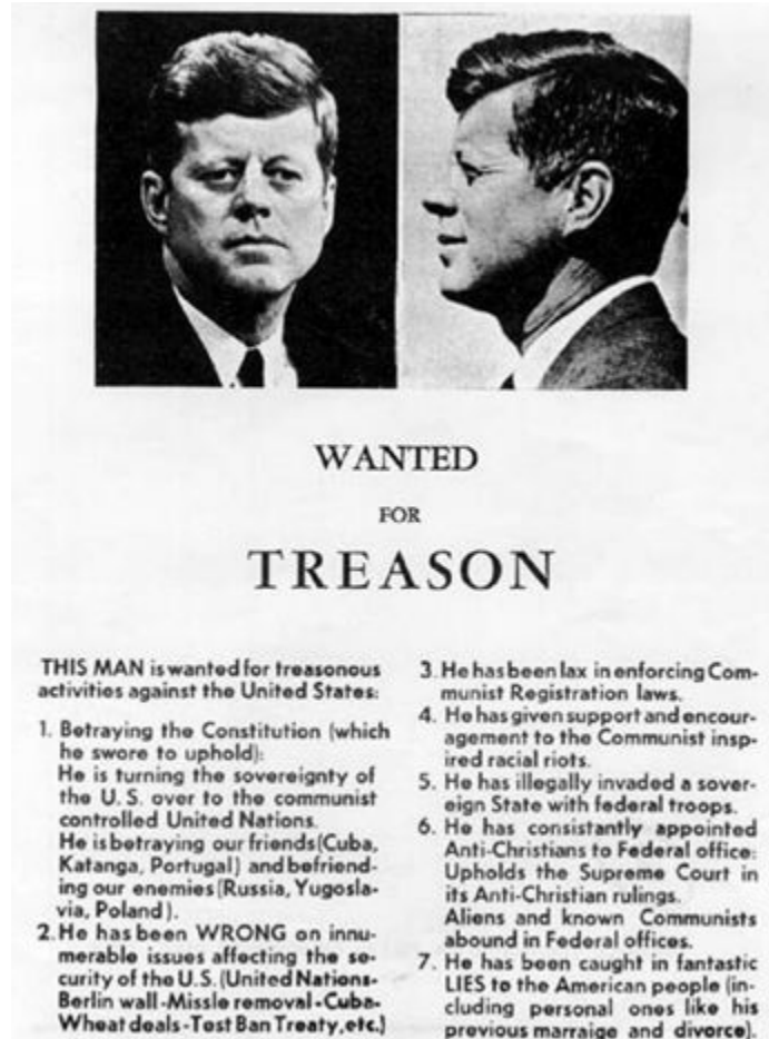
Fig. 4. THIS was a leaflet distributed in Dallas, TX one day before JFK's assassination, a typical CIA ploy to legitimize the set-up killer which the conservative local public will buy hands down...

On November 29, 1963, President Lyndon Johnson appointed Allen Dulles as one of seven commissioners of the Warren Commission to investigate the assassination of the U.S. President John F. Kennedy . . . Now then, is there really a question in our minds (the senior academic lot, if we would only enlighten the public), who killed JFK, in just reviewing the crucial biographic facts about one of the chief architects of the Cold War – Allen Welsh Dulles , his brother John Foster Dulles, and the rest of the deviant lot, the Washington Ruling Elite! Who organized the actual act and supervised the assassination event was the active director of the CIA – Allen Dulles.