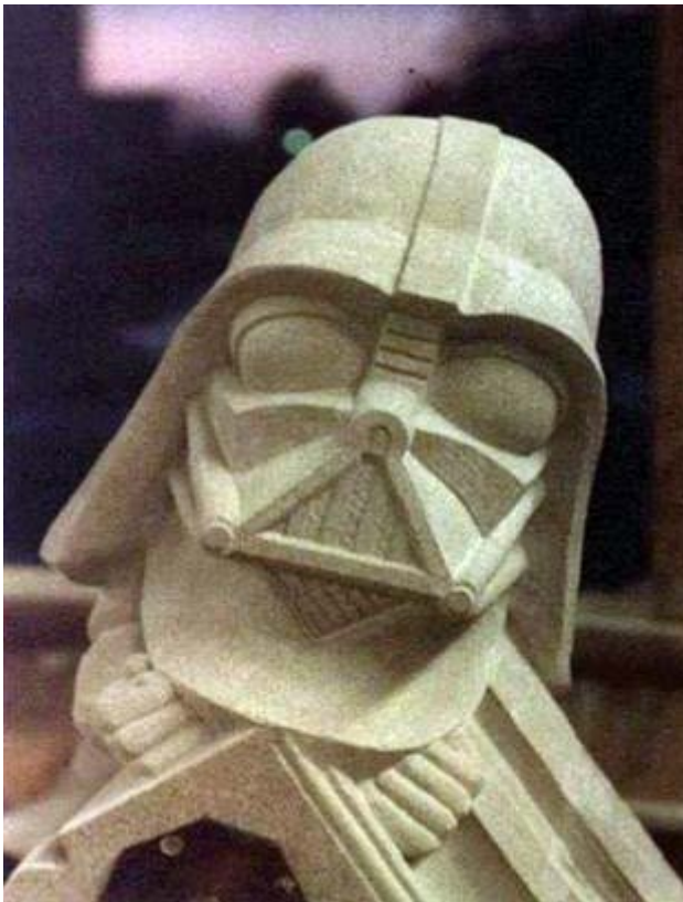
Fig. 77. Darth Vader , the Star Wars anti-hero, cut in stone and splashed as a gargoyle on the Washington National Cathedral , the nation's central house of worship, which sports nothing less than 112 gargoyles; demonstrating an uncanny similarity to Gaudi's upper floor of Villa Baglio.

The problem with our Gothic American establishment is that it needs graphic symbolism of Heraldry and Sci-Fi content to fire the atavistic imagination of the breed, unaware of good manners, selectivity, the reach for behavioral upper class acts, away from the barbaric origin pedestrian habits, hence the pagan gargoyles, pseudo-saints and feudal Heraldic heroes –all mixed in the same soup of tasteless irresponsibility of a sub-race of continentals with Oriental roots and horizontal intellectual values in the Occidental culture of WesternCiv, awfully short on etiquette, social manners, democratic political acumen, expressing downright aggressive posture sowing global conflict & resolution according to the Book of Goth! Obviously, spreading conflict, mayhem, and warfare, then showing up as arbiters to resolve the problem. If anyone objects to this barbarian approach, then we get bombed from aloft by high-tech aircraft – Tomahawk smart missile from Stealth aircraft?!