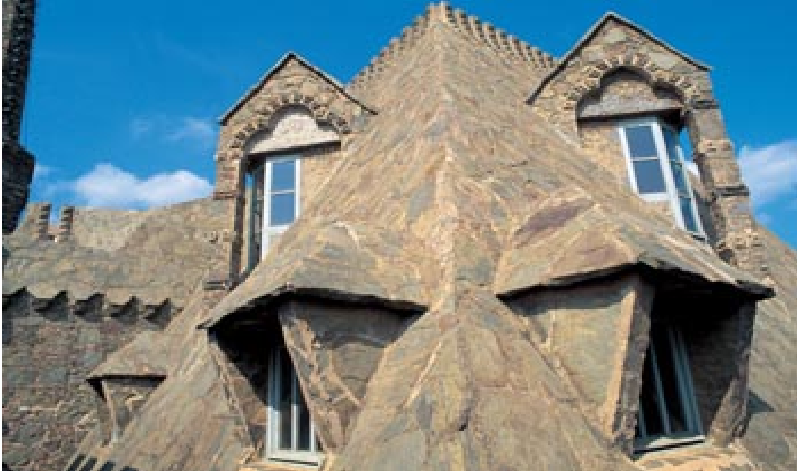
Fig. 76. From this angle, perhaps a coincidental giant head and nose of a Gaudi house in Barcelona, Spain. Yet, the famous Catalonian architect was into Heraldry, and so are the contemporary heroes of high-tech film lore.