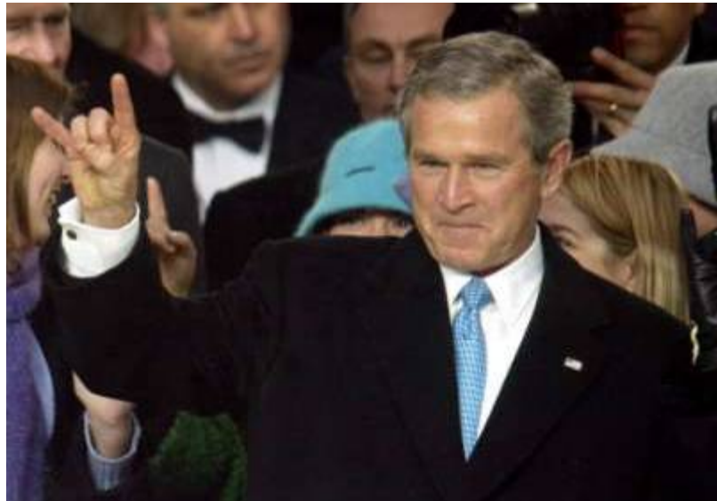
Signals of the hand of the devil were prevalent throughout the 2005 Bush, Jr. Presidential Inauguration!

rule over us to this very day. Everybody's equal, every race and creed, but for the Anglo-Saxon Ruling Elite, believe it or not Ripley, because, eg. the International Criminal Court, because of their self-assumed right to "make war for profit," we Americans (and I think the British) are not members! But soon, sooner they think, this elite will face it, including, sanctions, war reparations, and even worse, terminal sentences for wholesale crimes against Humanity!