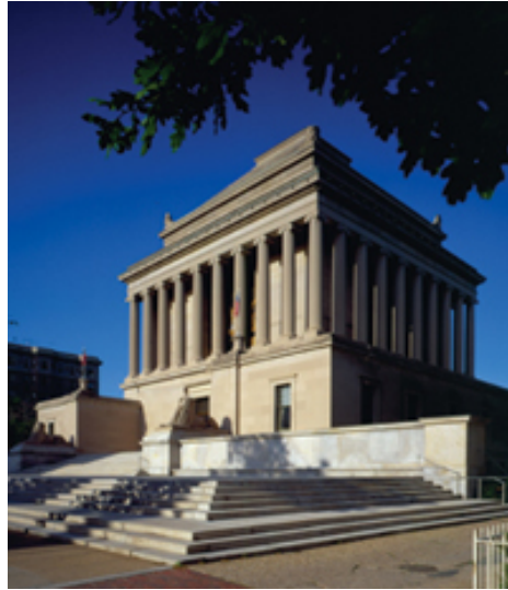
Fig. 81 The Masonic Temple in Washington.

The address is mentioned right in the beginning of the book and is a monumental building in Washington DC which has been the national headquarters of the Masonic Supreme Council since 1915. The building started in 1911 and was completed in 1915. Its architecture is an adaptation of the famous Mausoleum at Halicarnassus, one of the “Seven Wonders of the Ancient World.”