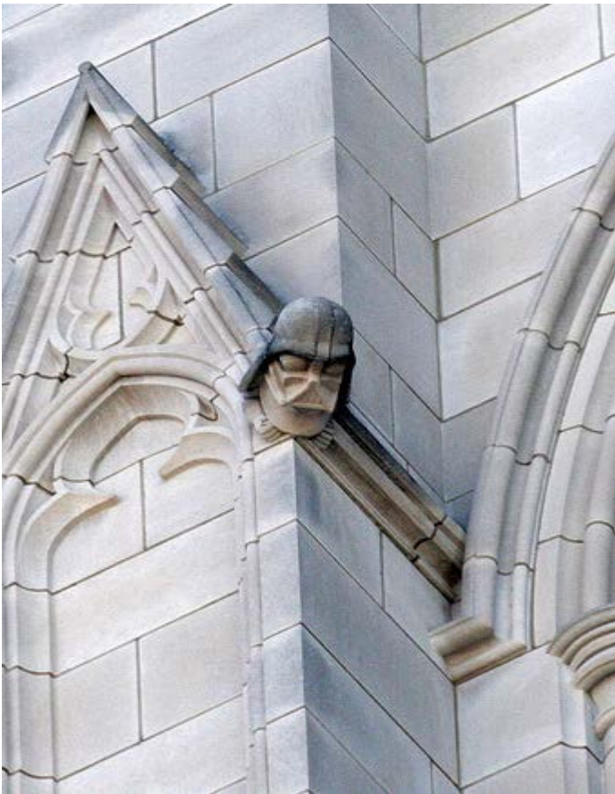
Fig. 75. Darth Vader from Star Wars on the facade of the National Cathedral (see full page, below).