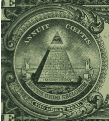
Fig. 66. The Great Seal of the United States.