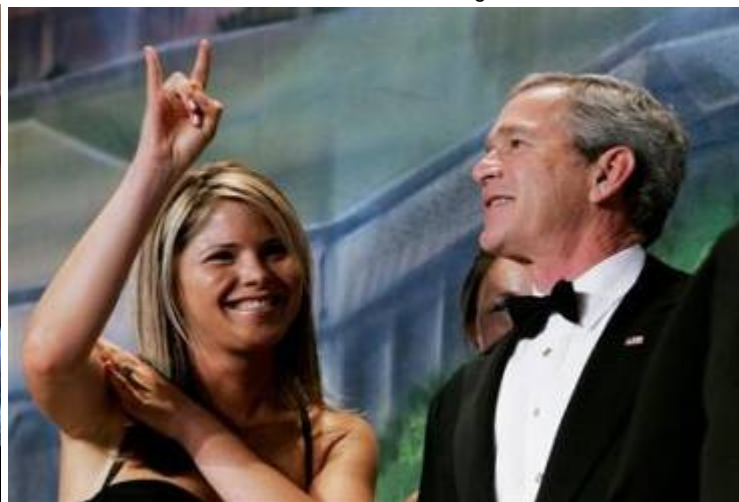
Fig. 70. The prince was giving someone the ax, not a Bonesman... The London-Washington ruling elite are into cabalism and sorcery, and who knows what or how, while they call the shots on conflict & resolution around the planetary meridians.

Can you imagine, this kind of sorcery practitioners declare illegal war at a whim on innocent (to forestall the national Treasury woes) sovereign nations around the world strictly "for profit"... In Dominance volume (Hong Kong, 2000), 160 pp paper-back, on the back cover I printed, how in the 1991 illegal Gulf War 420,000 children were de facto killed by the bombing raids by USAF, Tomahawk and other deadly missiles fired from the Sea, plus lack of baby food. Iraq was a big importer of Gerber baby food; USA illegal sanctions blacked baby, baby medicine, in fact every-thing was blocked, the blockade continue through the 2002-2010 Gulf War—that was still in progress with 52,000 infantry troops still on the ground fighting Iraqi resistance for the illegal invasion (against the UN Charter), the premeditative action, claiming WMD, turned out that poor ol' Saddam Hussein didn't even have a slingshot, yet George Bush, Jr. and Tony Blair, the two Anglo-Saxon heads of state ordered his hanging? It seems Blair admitted knowing how there was no WMD in Iraq, but nevertheless he put the British Armed forces in combat alongside the American brotherhood... What else could he do but – Semper Fi!