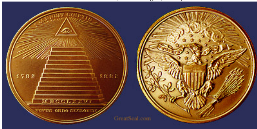
Fig. 82. The Great Seal is a cornerstone document in the foundation of America, created in 1782 – mid way between the Declaration of Independence and the Constitution.

Copyright©24 October 2010, by prof. Paul Cutter; all rights reserved, Old Town – Budva, Montenegro, Europe MNE