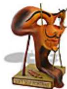
- Dali, portrait of Picasso