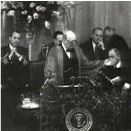
Fig. 2. Winston Churchill's Iron Curtain Speech!

The term "Empire" derives from the Latin "imperium", defined in C.T. Lewis' dictionary as "command, order, injunction, direction..." The Imperium in Rome had two main manifestations: (1) that of a public office or magistracy, and (2) that of military authority. From the second definition it becomes clear that American military imperialism, whichever the form applied or disguises used in its dogged insistence on inheritance of Pax Romana it's the most pure and simple form of contemporary empire-building, initially devised and administered by the American eastern establishment arriving on the continent mostly from Mother Lode – England. The American socio-political system is perfidious in form and totalitarian in content, for the following reasons: (a) in the greedy, ruthless, cold-blooded caprimulgus cadres system (the standard bearers) it selects to support the Ruling Elite throughout the government bureaucracy, rubber-stamped by the pervasive military-industrial complex norms, institutionalized by Max Weber's Protestant