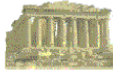
Octavian kills the Republic of Rome ancient concept of rule!