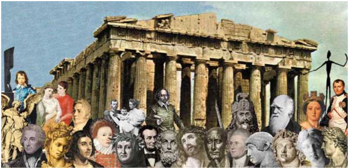
Fig. 2. Key to Figures and Images Displayed Above . . .

YET, these men of knowledge, wisdom and progress, in the West at least, generally speaking were not only exploiters, dictators and totalitarians for their own benefit, ends and means, though there were exceptions, but more often than not brought with them social change, knowledge, democracy and progress to those lands which were imperially conquered, encircled and contained, i.e. the prime example of the lasting British Empire (for centuries, now its dominions lost), left behind intrinsic social values of Western progress.