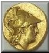
(Alexander or Athene)